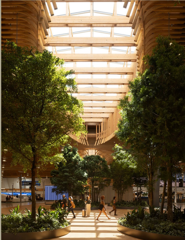
Image: KPFF, "Portland International Airport [PDX], Terminal Core Redevelopment"