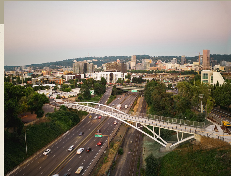
Image: KPFF, "Congressman Earl Blumenauer Bicycle and Pedestrian Bridge"

The span is also a key link in the City's Green Loop that will eventually provide walking and cycling options around the central city and the Willamette River. Due to its highly-visible location, aesthetic design concepts and size, the Blumenauer Bridge is a signature structure for the City.